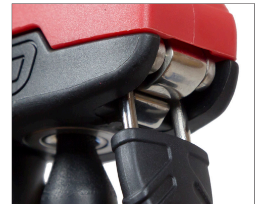
ONE-STEP CLICK-IN RELOAD